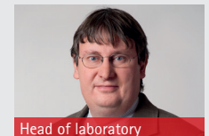
Head of laboratory