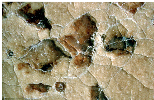
Example of an inelastic cork coating with cracks after castor chair test acc. to EN 425