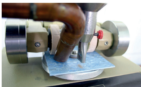
Determination of the abrasion resistance with falling sand test acc. to EN 660-2

Entwicklungs- und Prueflabor Holztechnologie GmbH