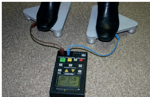
Determination of the electrical resistance acc. to EN 1081