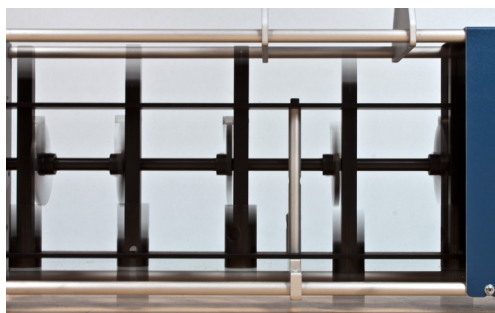
Fig. 4: Standard tapping machine to excite noise per DIN EN ISO 140-8 respectively DIN EN ISO 10140-5 (impact noise)

Both the raw ceiling (i.e. without a flooring laid) and the entire floor/raw ceiling structure (raw ceiling with flooring laid) are stimulated and measured. Conclusions regarding the ability of the floor to reduce impact noise emissions are derived from both tests. This is expressed via the so-called evaluated impact noise insulation \Delta L_W (unit: dB).