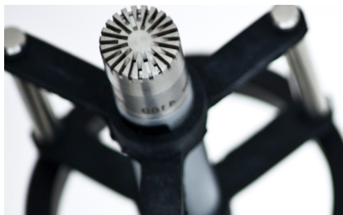
Fig. 3: Microphone for testing