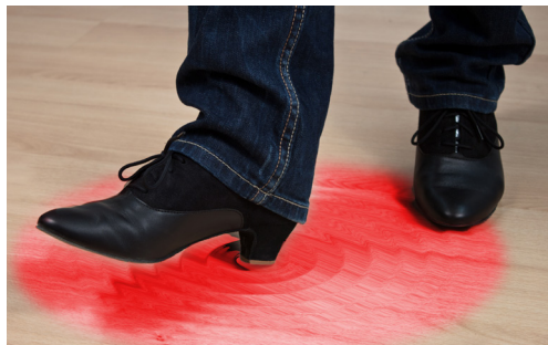
Fig. 1 Excitation of the flooring (by hitting the surface) and sound emission

The emitted sound can be influenced significantly by the construction of the flooring. Test methods for walking sound and impact noise are presented below.